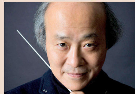
TADAAKI OTAKA