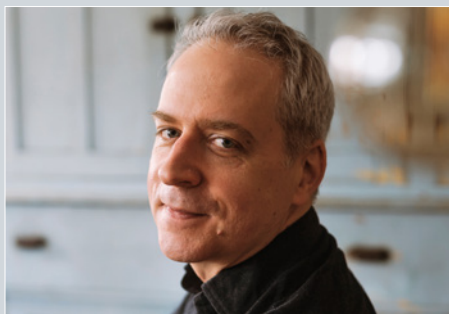
JEREMY DENK