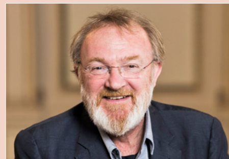
MARTYN BRABBINS