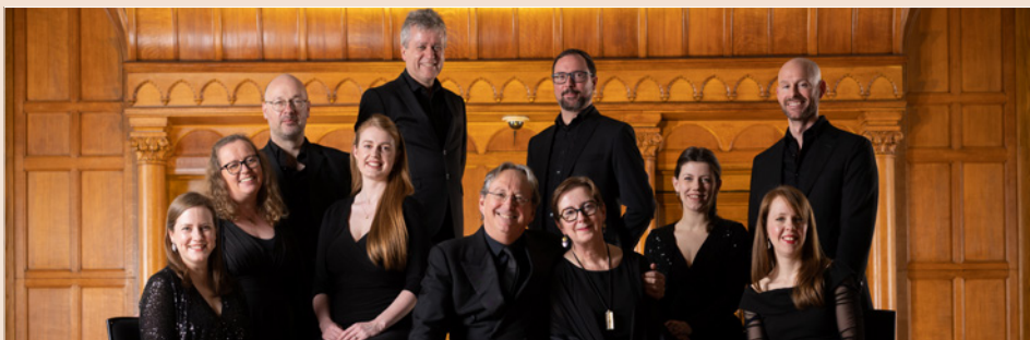
TALLIS SCHOLARS | Llund