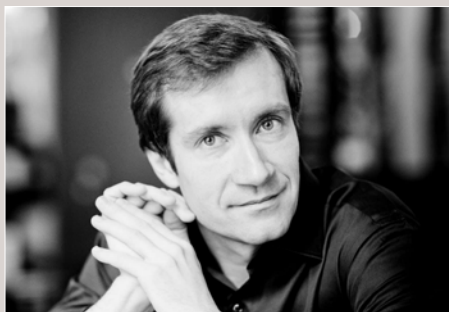
NIKOLAI LUGANSKY